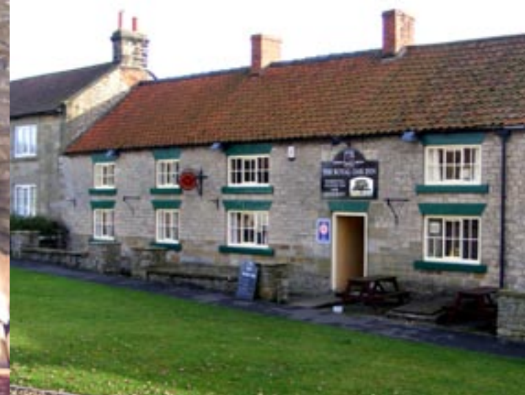
The Royal Oak Inn, Gillamoor