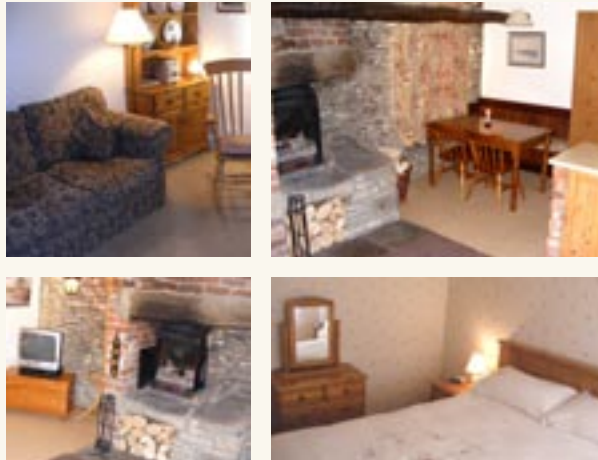
Interior pictures of Blacksmiths Cottage

All on ground floor level, Blacksmiths cottage is comfortable and welcoming at any time of the year. The cottage is well equipped and tastefully decorated throughout. During the winter months, real log fires can be enjoyed in the beautiful old forge fireplace.