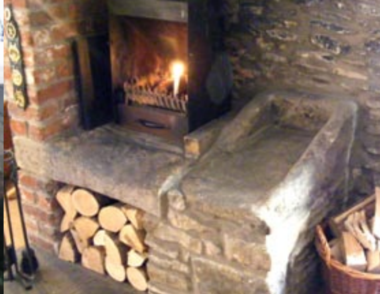
Blacksmiths forge fireplace in the Blacksmiths Cottage